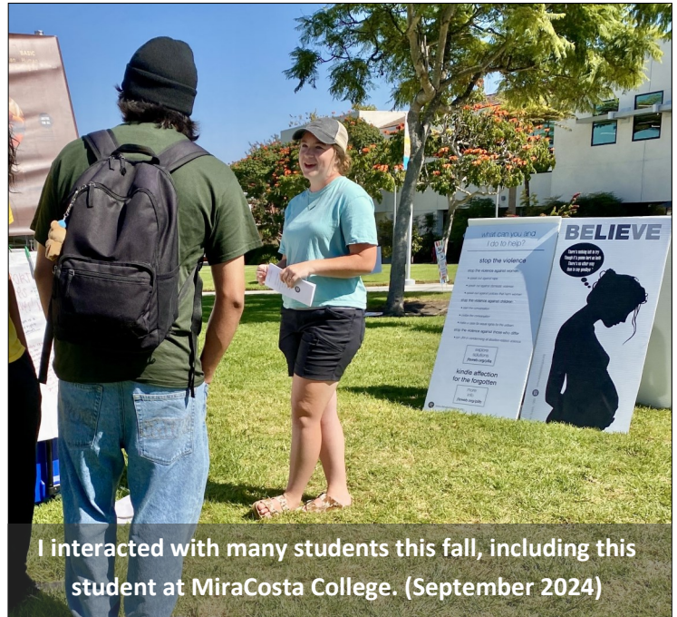
I interacted with many students this fall, including this student at MiraCosta College. (September 2024)