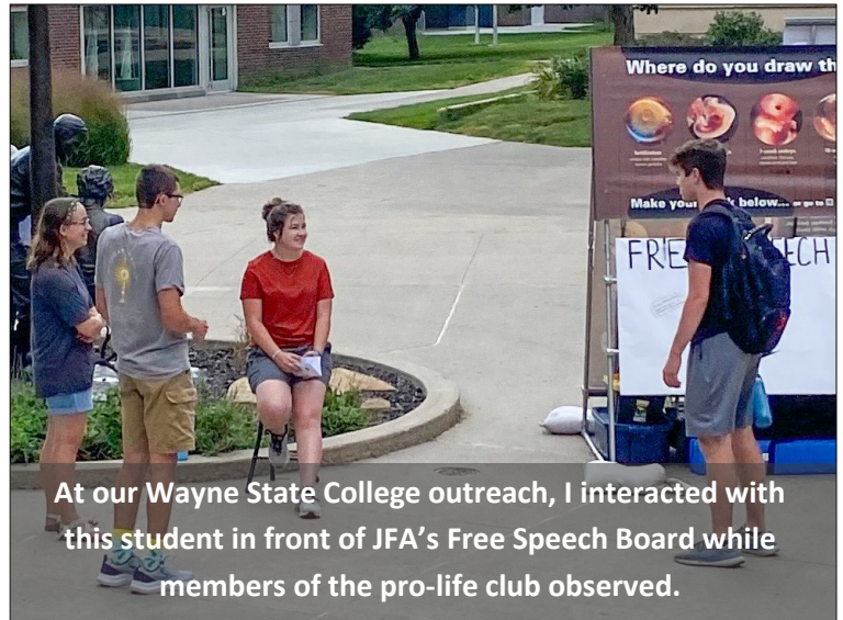
At our Wayne State College outreach, I interacted with this student in front of JFA’s Free Speech Board while members of the pro-life club observed.