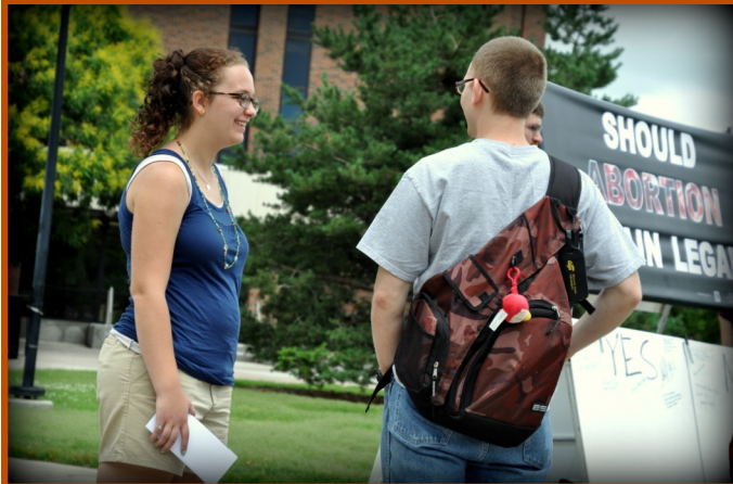
I had a good time talking with this pro-life student at Wichita State University!