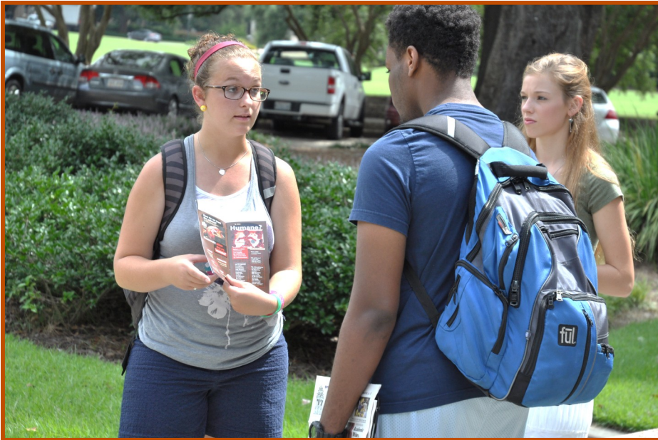
I had a great opportunity to mentor a high school student in the midst of this conversation at Louisiana State University.

extremely challenging to spread the Gospel. The JFA staff then spent several minutes discussing how far and to what places Christians should go to spread the love of Jesus. It was then that another one of my colleagues spoke up and said something that pricked my heart: