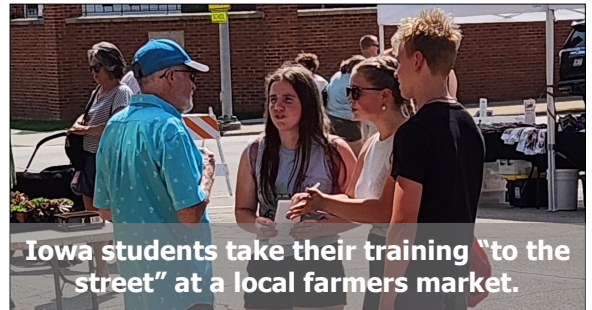
Iowa students take their training "to the street" at a local farmers market.

"It gave me an urgency to not only give voice to the unborn child but also the post-abortive woman. This class really opened my eyes to the horror of abortion and the need for healing that mothers and fathers who have lost babies to abortion have."