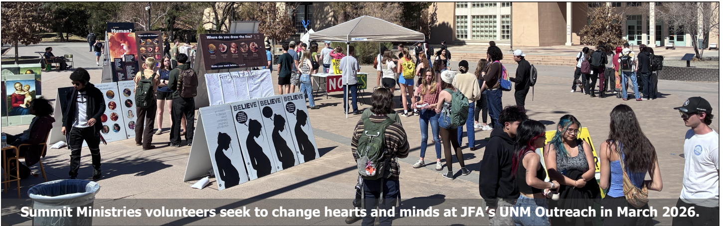
Summit Ministries volunteers seek to change hearts and minds at JFA's UNM Outreach in March 2026.

It was truly inspiring to work with students from Summit Ministries in March! They drove from Colorado and participated in our apologetics seminar and then joined us for two days at the University of New Mexico (UNM). These young leaders stood out by stepping forward with courage and initiative, boldly starting conversations with students across campus.