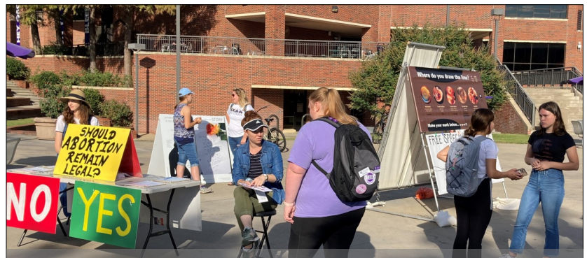
Tarleton State University in Stephenville, TX (Sept. 27-28): During our first-ever outreach event at this campus, we felt great support from the community. One local had been praying for years for more campus engagement on abortion.