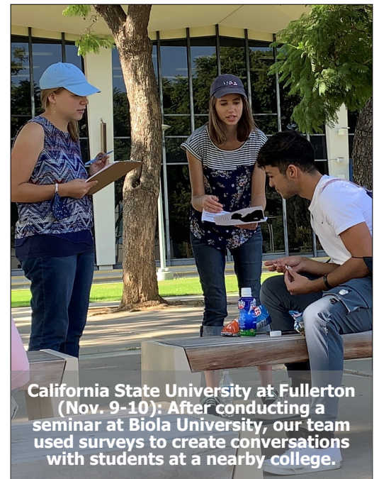
California State University at Fullerton (Nov. 9-10): After conducting a seminar at Biola University, our team used surveys to create conversations with students at a nearby college.

See www.jfaweb.org/love3 for upcoming Love3 workshops.