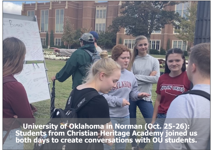
University of Oklahoma in Norman (Oct. 25-26): Students from Christian Heritage Academy joined us both days to create conversations with OU students.