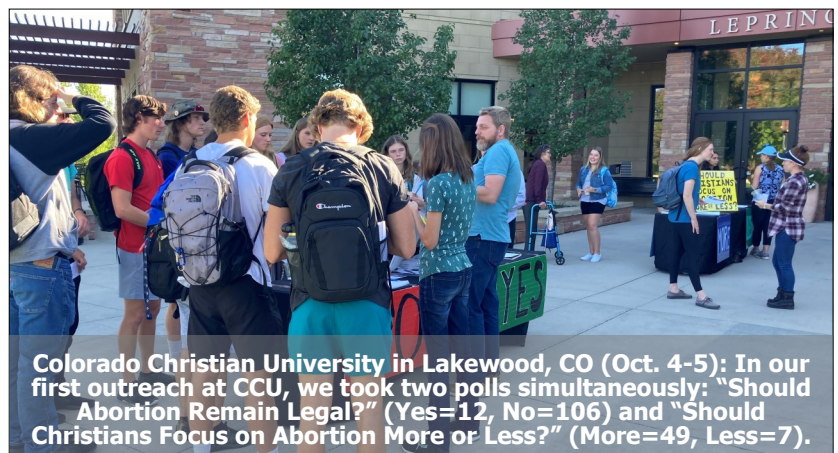
Colorado Christian University in Lakewood, CO (Oct. 4-5): In our first outreach at CCU, we took two polls simultaneously: "Should Abortion Remain Legal?" (Yes=12, No=106) and "Should Christians Focus on Abortion More or Less?" (More=49, Less=7).