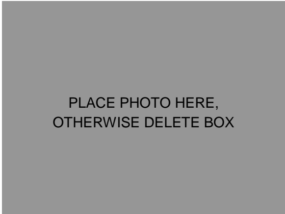
Photo captions speak volumes of their subject matter, so spend a moment to explain what's really going on in graphs and photographs.

“INSERT PULL QUOTE HERE. DELETE BOX IF NOT IN USE.”