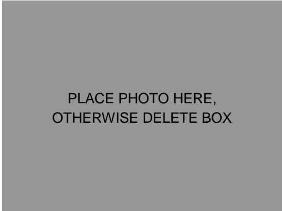
Photo captions speak volumes of their subject matter, so spend a moment to explain what's really going on in graphs and photographs.

Continue newsletter text here. Continue newsletter text here. Continue newsletter text here. Continue newsletter text here. Continue newsletter text here. Continue newsletter text here. Continue newsletter text here. Continue newsletter text here. Continue newsletter text here. Continue newsletter text here.