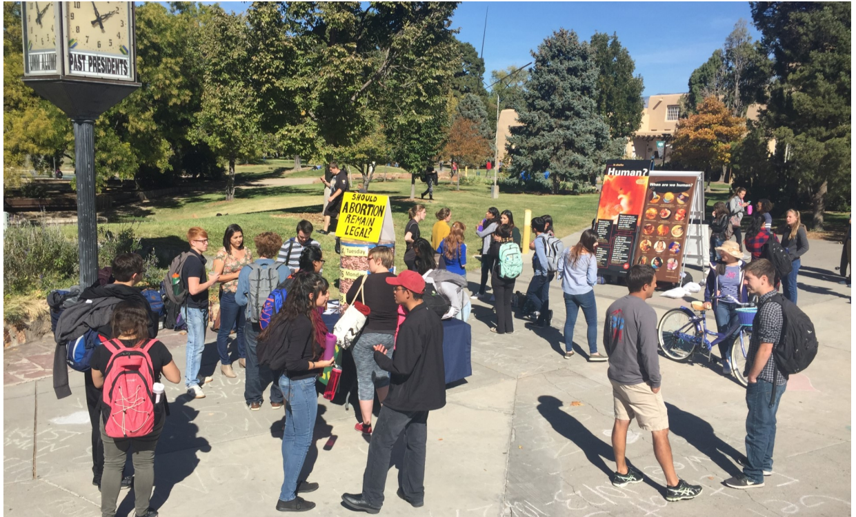
Sometimes even I am amazed by the number of conversations about abortion that we can generate at a pro-choice-leaning school like the University of New Mexico with just our small kiosk, a poll table, a few staff members, and a few volunteers.

However, since we will probably never see major newspaper headlines about the children killed by abortion, how will people hear the news? One of the unique things about the tragedy of abortion is that many of these deaths can be prevented by conversations that make the injustice unthinkable. It is always unbelievable to me how God uses our small team to reach so many people each semester. Each of those people could have an opportunity to save a child's life in the future, and prevent them from being added to the next monthly abortion statistic. Over the four years I've been doing this work, I've seen first-hand how a single conversation can really make a difference in someone's life and the lives of their future children.