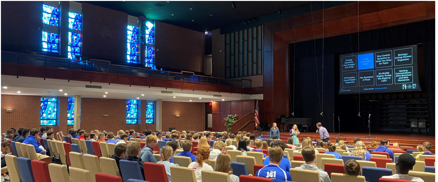
At Christian Heritage Academy in Oklahoma, for the first time we equipped the whole high school rather than just the Salt and Light club as we have in previous years.