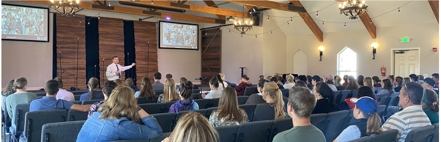
We were given a whole day to train students at Ellerslie Mission Society in Windsor, Colorado as we have been doing every semester for the last few years.

“I feel equipped and encouraged and even excited!”