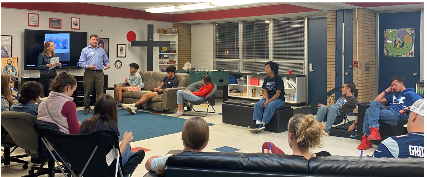
In Colorado we taught this Catholic high school youth group. As you can see, some students were more interested than others!