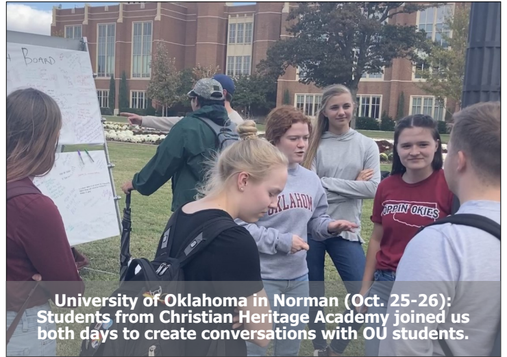
University of Oklahoma in Norman (Oct. 25-26): Students from Christian Heritage Academy joined us both days to create conversations with OU students.