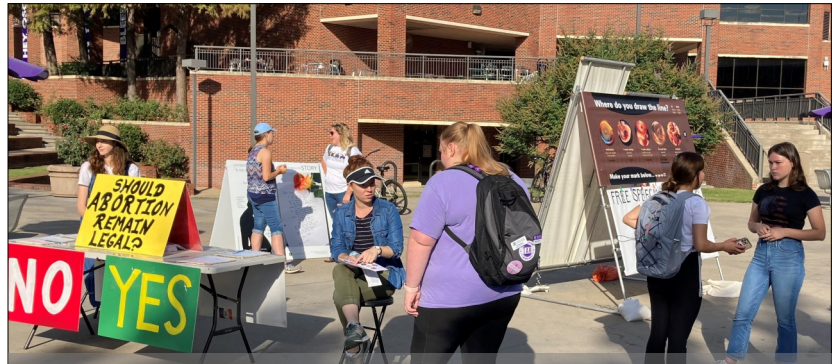
Tarleton State University in Stephenville, TX (Sept. 27-28): During our first-ever outreach event at this campus, we felt great support from the community. One local had been praying for years for more campus engagement on abortion.