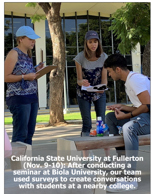
California State University at Fullerton (Nov. 9-10): After conducting a seminar at Biola University, our team used surveys to create conversations with students at a nearby college.

See www.jfaweb.org/love3 for upcoming Love3 workshops.