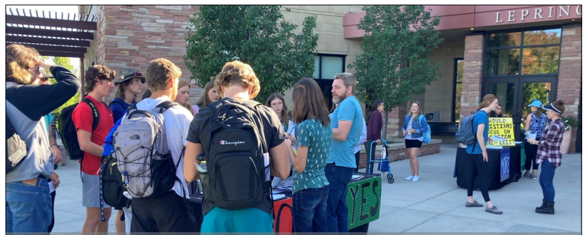
Colorado Christian University in Lakewood, CO (Oct. 4-5): In our first outreach at CCU, we took two polls simultaneously: "Should Abortion Remain Legal?" (Yes=12, No=106) and "Should Christians Focus on Abortion More or Less?" (More=49, Less=7).