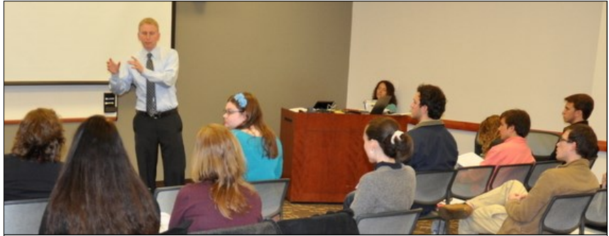
At a JFA seminar in March, I prepared University of Georgia students to respond to the abortion injustice with urgency and compassion.