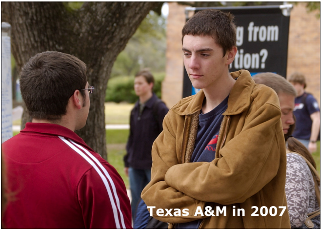
Listening to a student at a JFA outreach.

One of the most memorable conversations I ever had with JFA was on the campus of Texas A&M. I approached a student who was looking at the exhibit and asked him what he thought about the issue. He said that he personally