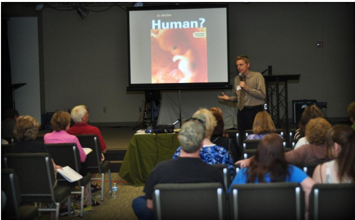
While I was in the Santa Barbara area, several other JFA staff trained dedicated volunteers near Fresno, CA.