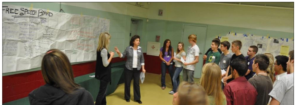
Part of our team trained students at FCA near Denver, Colorado.

This year was no different. Although we had some protestors trying to squelch dialogue (one person even attempted to vandalize our display), our group of volunteers remained steadfast and graciously engaged the community. Students from Dayspring Christian Academy in Greeley (DCA) and Faith Christian Academy (FCA) in Arvada, Colorado, joined us for the outreach, and they came away strengthened for future conversations in everyday life. Before our outreach days, I helped with two of our seminars in Fort Collins, Colorado.