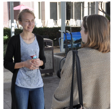
2014 Outreach at ASU

Below there was a free speech board where you could physically draw the line and then add any comments.