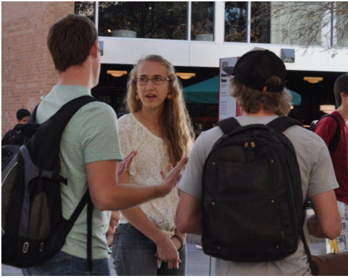
At the ASU campus in 2015 talking with two pro-life men who wanted to know how to create productive conversations with their pro-choice friends