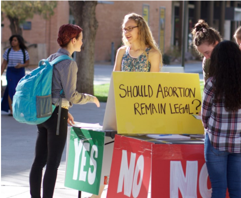
Arizona State University, February 2017