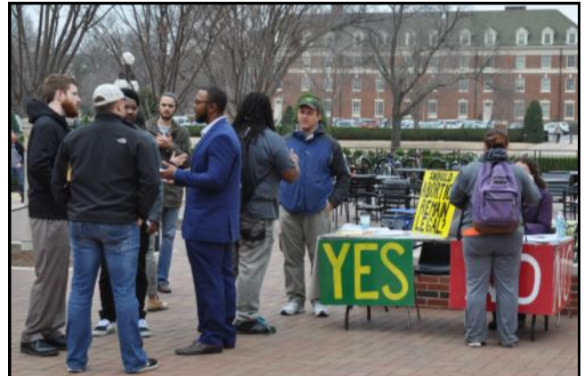
We did this poll table outreach on February 27, 2017 at Oklahoma State University. You can see me in conversation in the middle of the photo surrounded by others who are having their own conversations.