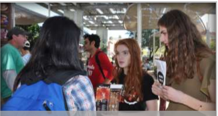
Through practice, students are ready to share images respectfully in future conversations.

sequenced training program had helped them become ready and eager for the next conversation.