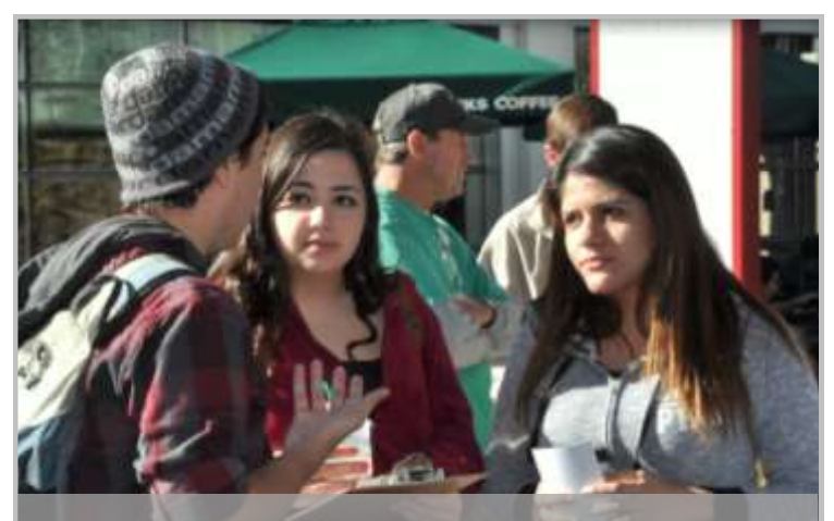
Students from St. Mary's Catholic High School survey a student at Arizona State University.

Of the 44 students (and one faculty member) from these Phoenix schools who participated in a day-long seminar (Seat Work) and a day of outreach at Arizona State University (Feet Work), all but a few made a commitment to create a conversation about abortion in their everyday lives within two weeks (what JFA calls "Repeat Work"). JFA's carefully