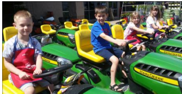
My kids wanted me to capture this photo of them after a recent Build and Grow Clinic at Lowe's.