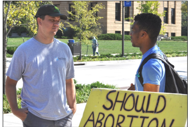
Chancellor and I converse at KU about abortion in the case of rape.

Chancellor walked up to the table to sign the "YES" side, but he hesitated. Standing nearby, I asked which side he was