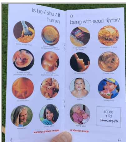
JFA Brochure, pp. 4-5

I began explaining the JFA "Invitation to Dialogue" Brochure. I gave a summary of basic human reproduction and biology on the pages depicting stages of human life, before and after birth. He agreed that the unborn is a developing human at fertilization, but it needs a heartbeat to be a human being.