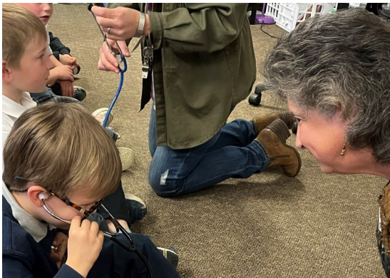
Listening to our heartbeats