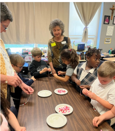
Grades K-2 making a string of beads as a reminder of what they learned