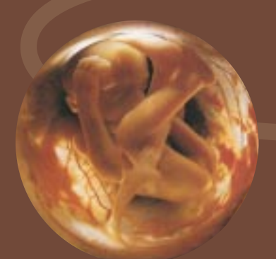
2nd trimester fetus (18 wks.)