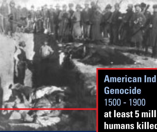
American Indian at least 5 million humans killed

American Unborn Genocide 1973 - present 40 million humans killed (and counting)