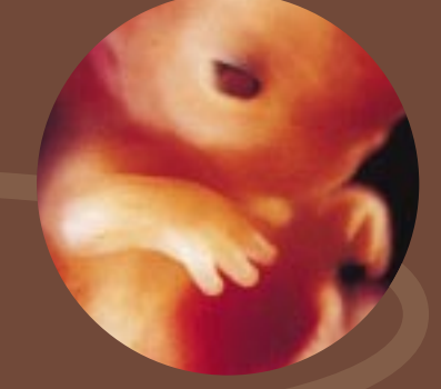
7 week embryo (brainwaves at 6 wks)