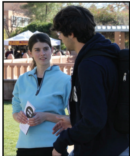
In dialogue with a student at Arizona State University, February 2011.