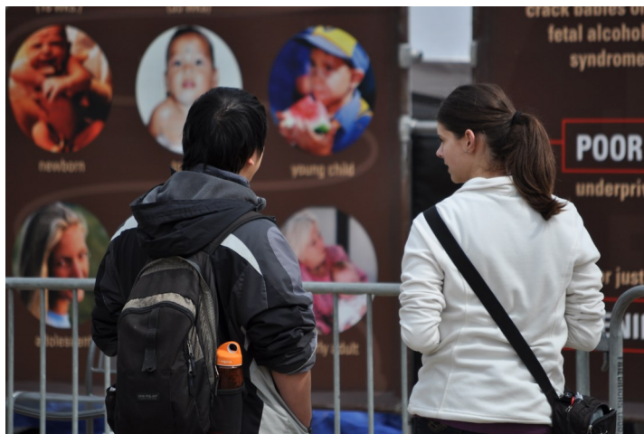
Here I talk with a foreign exchange student from China at Georgia Tech in Atlanta. We discuss whether or not the unborn is biologically a human being and if our human nature is what makes human beings valuable.