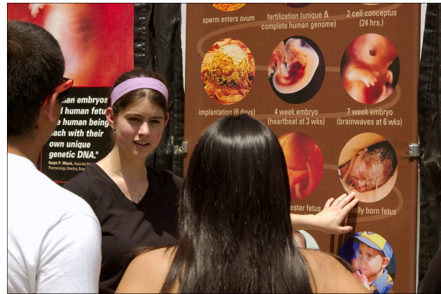
Me discussing when life begins with (PCC) students at JFA's California outreach in May.

I saw the effectiveness of this "training others to train others" first hand during the community/student