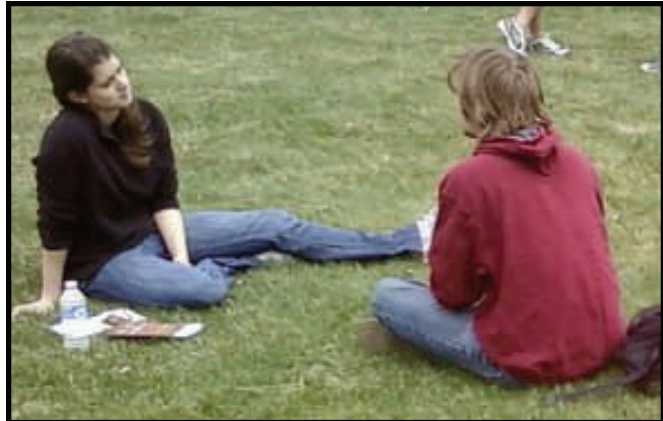
Above: Discussing the existence of God and value of unborn children with an atheist from the University of Northern Colorado—Greeley.