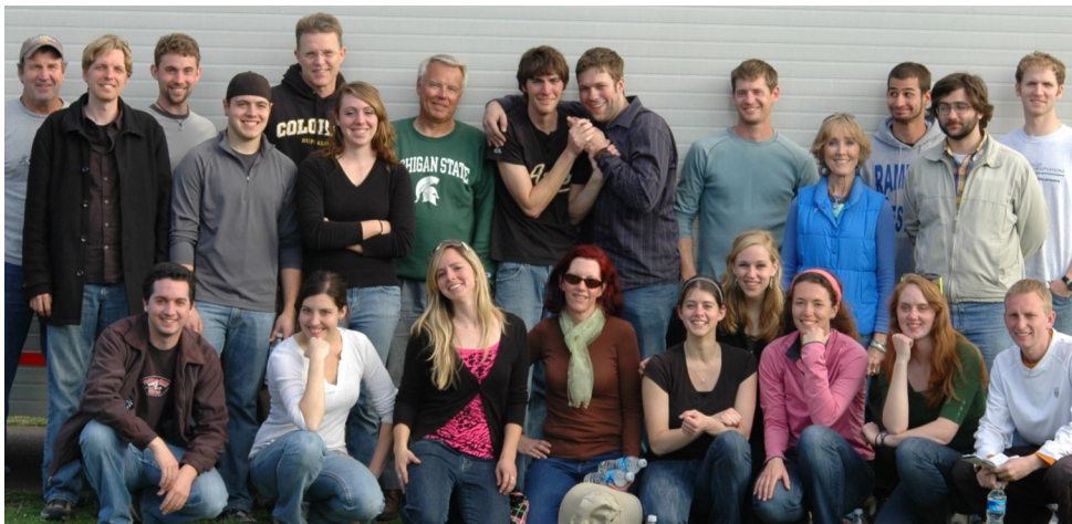
Our great crew of staff and volunteers at Middle Tennessee State University in March!