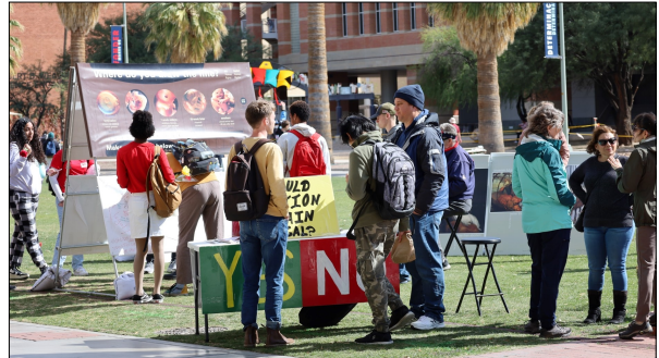
See pictures of recent events at www.instagram.com/picturejusticeforall

Recent Outreach Event at University of Arizona