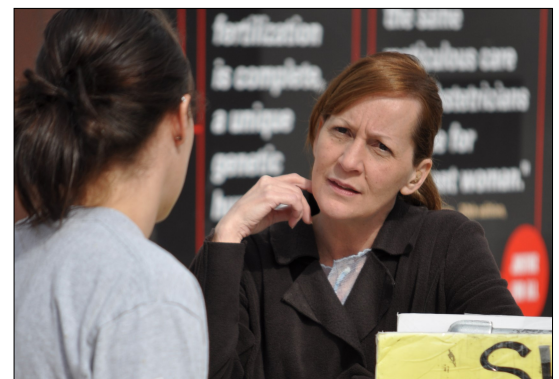
Colorado State University, April 2012