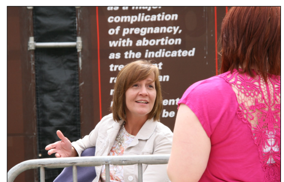
Univ. of Northern Colorado, April 2010