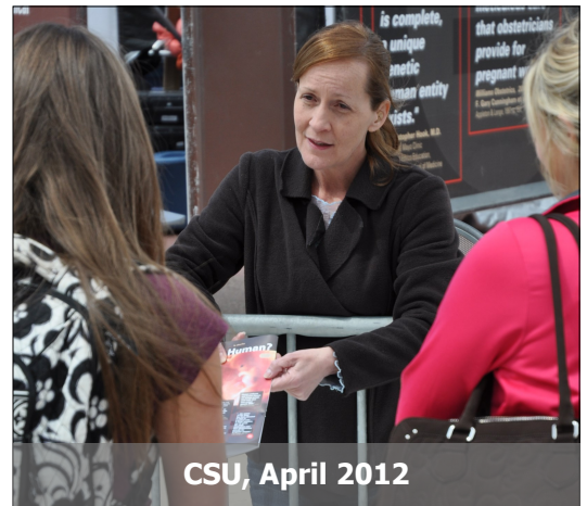
CSU, April 2012