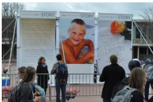
The JFA Stop and Think Exhibit at CSU